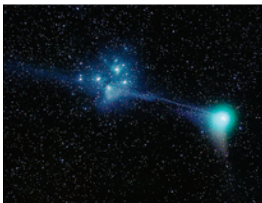
Comet Machholz was passing the Pleiades cluster when Stefan Seip at Oberjoch, Germany, photographed it on the evening of January 7 th , 2005.

However, looking deeper into the prophecies we see that at the exact time of the strike and tsunami on Dec. 26, 2004, the so-called